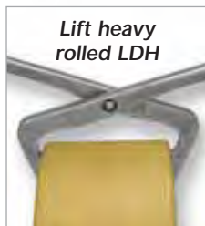
Lift heavy rolled LDH