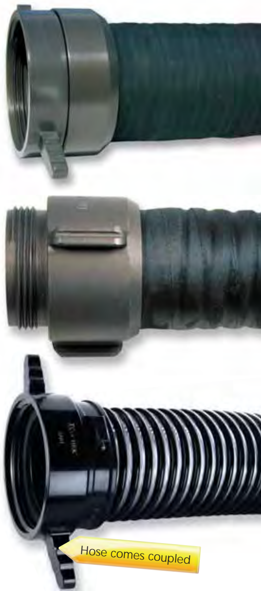
Hose comes coupled