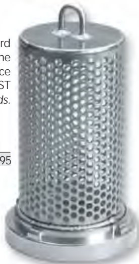
See page 35 for more strainers