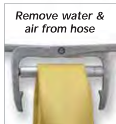
Remove water & air from hose