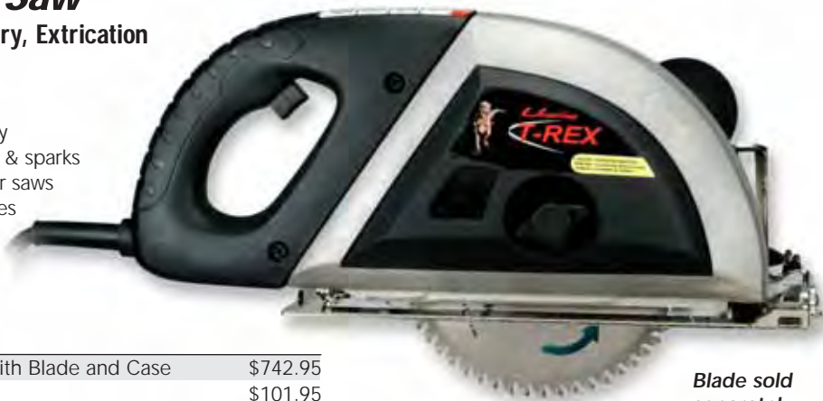
Blade sold separately