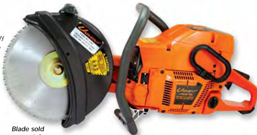
Blade sold separately