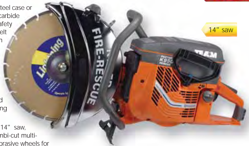
Blade Sold Separately

AW198 Contains: TEAM/Partner K-12 FD 14" saw, diamond plate aluminum case, advanced Combi-cut multi-purpose "Carbide Chip" blade, four rescue abrasive wheels for cutting both steel and concrete, safety gas can, hearing protector, goggles, spare belt and air filter, air filter oil, 2-cycle engine oil, can of gasoline stabilizer, combination screwdriver/wrench and instruction manual.